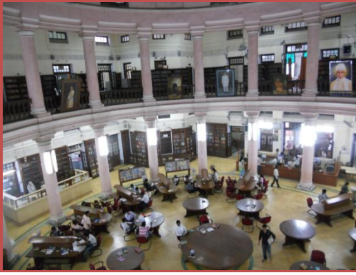
Central Library Hall, BHU

“Knowledge is Power, Information is Liberating, Education is the premises of progress, in every society, in every Nation”